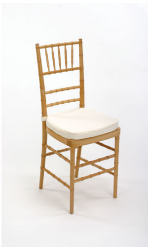
Chiavari Chair | 7 colors originally $10.80-$12.80* ea w/cushion *price varies depending on color