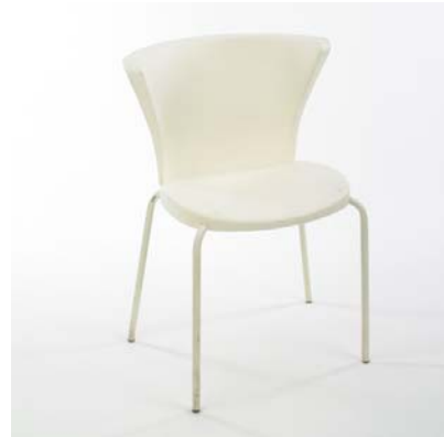
Moderna Chair | off-white originally $5.00 ea