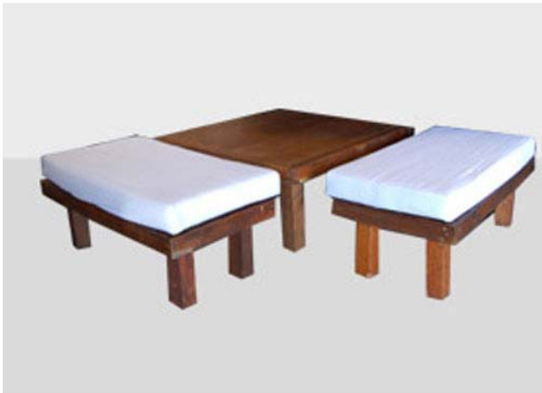
Descanso Table | 4x4 originally $60.00 ea Descanso Bench | 2 x4 originally $60.00 a pair w/ cushions* *while supplies last